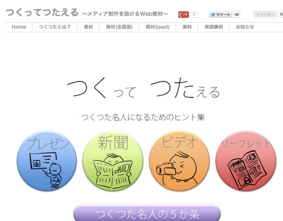
Figure 1. The top page of the material

Figure 1 is the top page of the material. It targets four types of media production: presentation slides, newspapers, leaflets and videos. Each material includes six points, which help students to reflect on their own activities. The points consist of a four-scaled rubric, samples of each description of the rubric, and explanation movies of the samples. Taken together, 96 samples and explanations are available.