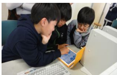
Figure 5. Self-evaluation after watching the materials

Besides the five teachers, a few of their colleagues also used the materials. Finally, by March 2012, 12 classrooms used the materials in a total of 33 lessons among seven different units. Here is an example of the materials being used in a 5 th grade social studies lesson. Students formed groups and created presentation slides about the automotive industry. In the middle of the unit, they used the materials for a self-evaluation activity. The teacher handed the students worksheets for entering the score of their self-evaluation and writing plans for improving their products (Figure 5). Like self-regulated learning (Zimmerman, 1990), the students evaluated their products with metacognition triggered by the materials.