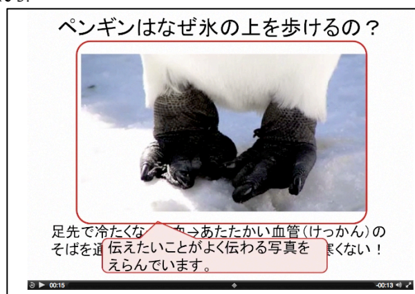
Figure 4. Explanation movie of the sample in figure 3

Explanations of the samples are movies, which include annotations by subtitles and animations. In addition, to let students understand points of the explanation, a summary of the explanation was shown at the end of the movie. Figure 4 shows a scene of the explanation movie about the same sample in figure 3.