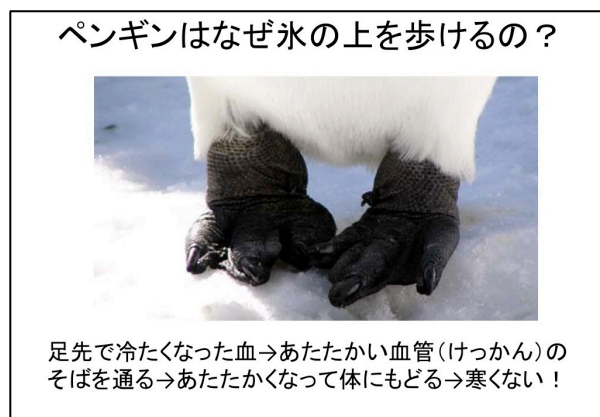
Figure 3. Sample of the description on a rubric

We prepared concrete sample images or movies for each description of the rubric. Figure 3 is a sample of criterion “A” about figures and pictures in presentations. To avoid overlapping with the work of students, themes of all samples were different from any subjects and curriculum or used imaginary settings. The movies were under 30 seconds long, as students easily understand the point.